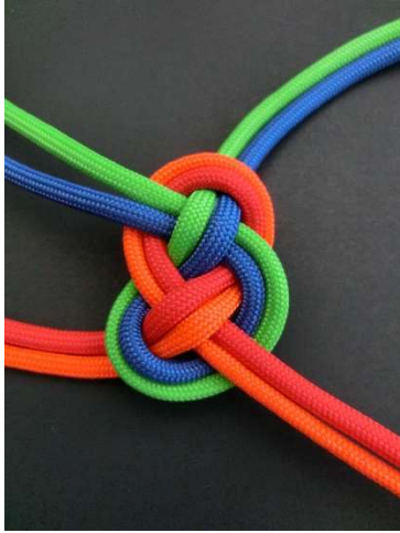
A row of knots

4. Gently pull all the strands to tighten the knot. Arrange the strands and flatten the knot.