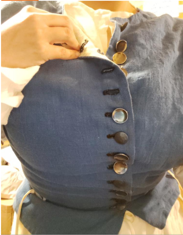
Detail of buttonholes and eyelets for ties.