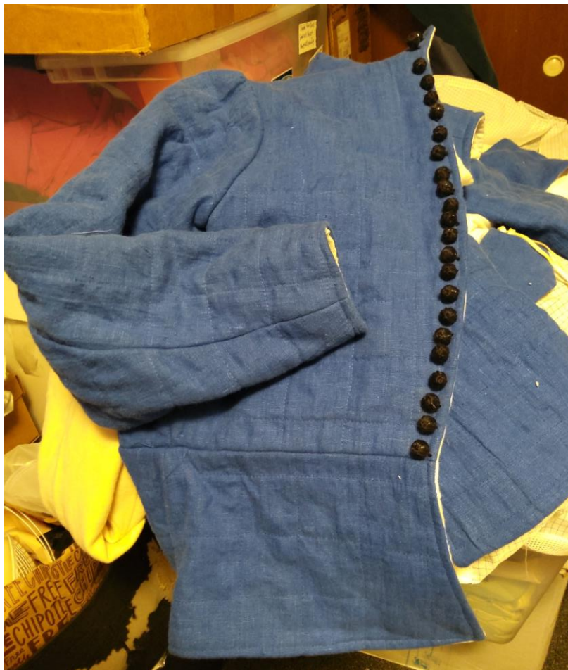
Detail of thread covered buttons, quilting and hand buttonholes.